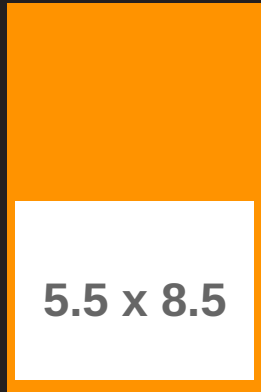
Half Page Ad $175