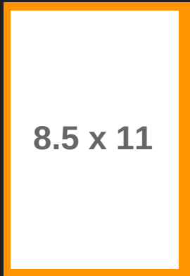
Full Page Ad $250

Want to spread the word about your goods and services? Program ads are the way to go! Each conference attendee and vendor receives a program with registration that will be used throughout the conference.