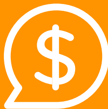
EXHIBIT HALL PACKAGES

PRICE: $550 (before 9/1/18) $600 (after 9/1/18)